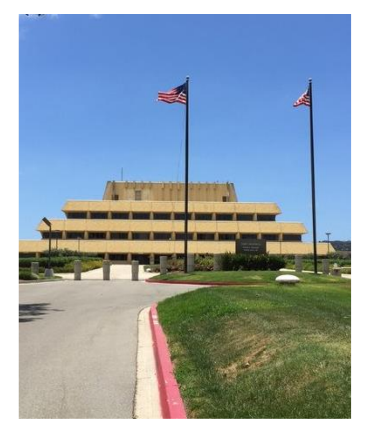
California Service Center in Laguna Niguel, CA.