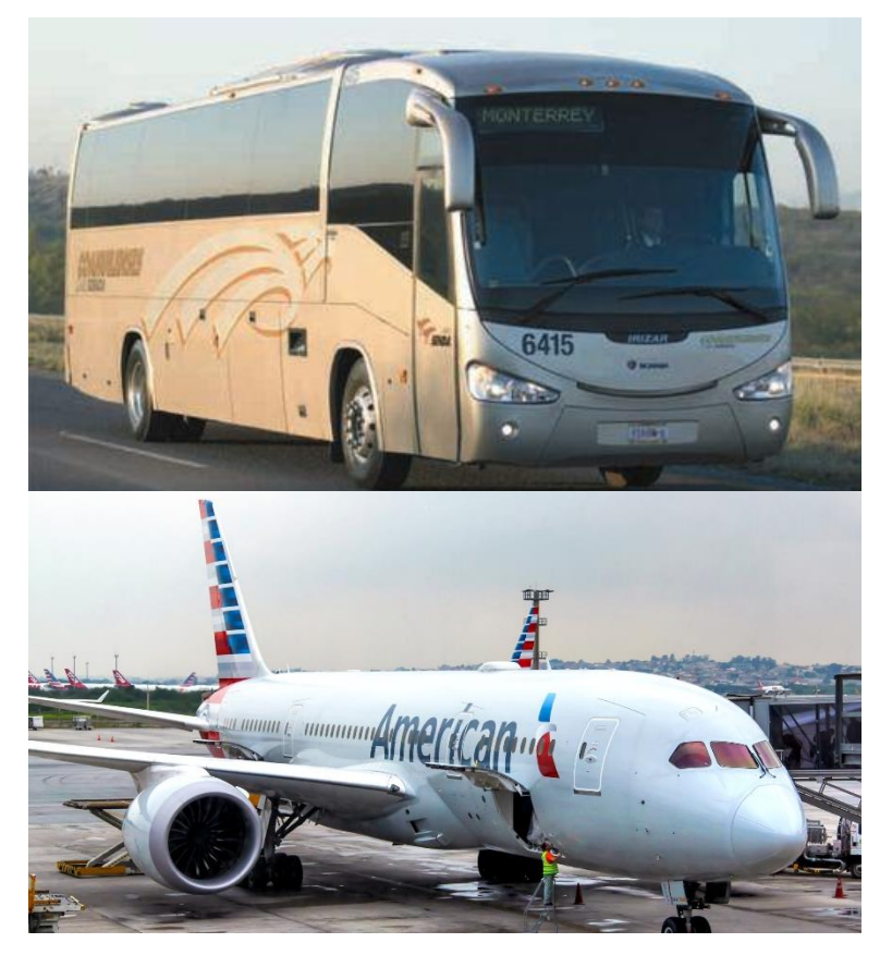
Mexican workers typically travel by bus. Workers from countries other than Mexico must travel by air.