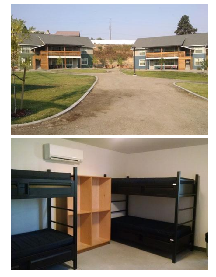
Washington Growers League's Brender Creek farmworker housing in Cashmere, WA.